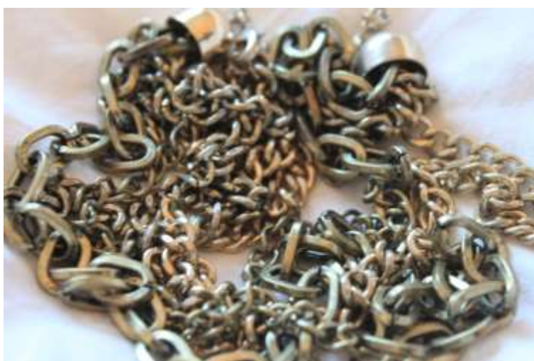
Photo 10 - We are like a chain. A tight group.

The saying about the Finland-Swedes is that everybody knows everybody since it is a small group and the students say this too with their photos and in their interviews. The language is perceived by the students to be the common glue together with the Swedish-speaking school. Interestingly the students have redefined who is a Finland-Swede. It used to be defined as a person who registered as a Swedish speaker, but the students have redefined it as someone who speaks both Swedish and Finnish and goes to a Swedish-speaking school. Hence, especially the photographs depict a language group which position is not static but in constant movement.