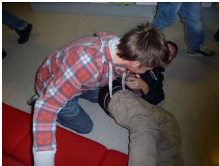
Photo 11 - We always have fun, even in school.