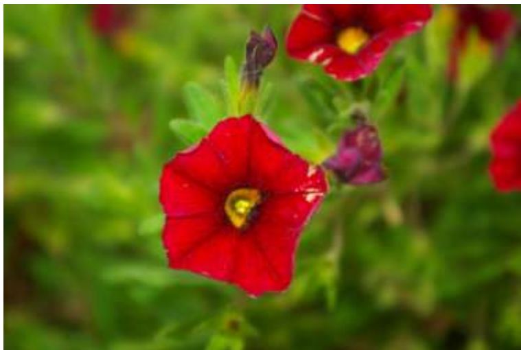
Photo 8 - The flowers symbolize the beautiful Swedish language

The symbolic or metaphorical photography provides a vehicle for the students to express their more abstract thinking about their identifications and belonging.