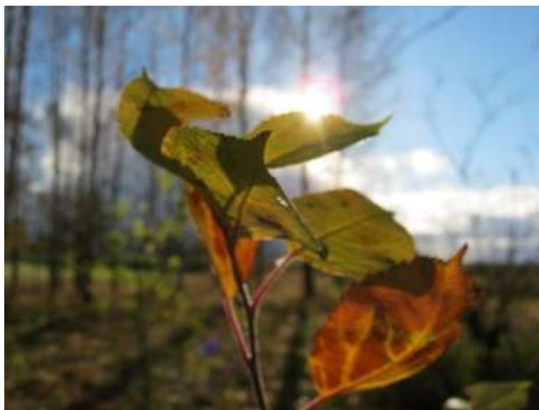
Photo 15 - Finland-Swedishness is like fall, a time no one really looks forward to