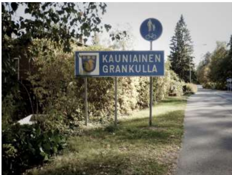
Photo 7 - Many Swedish-speakers live in this community (bilingual sign)

Likewise there are numerous photos of bilingual street signs through which the students in a way show the group's existence since the streets signs are only in Finnish unless the municipality contains 8% Swedish minority language speakers.