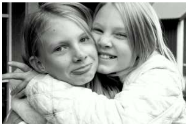
Photo 1 - Belonging and togetherness