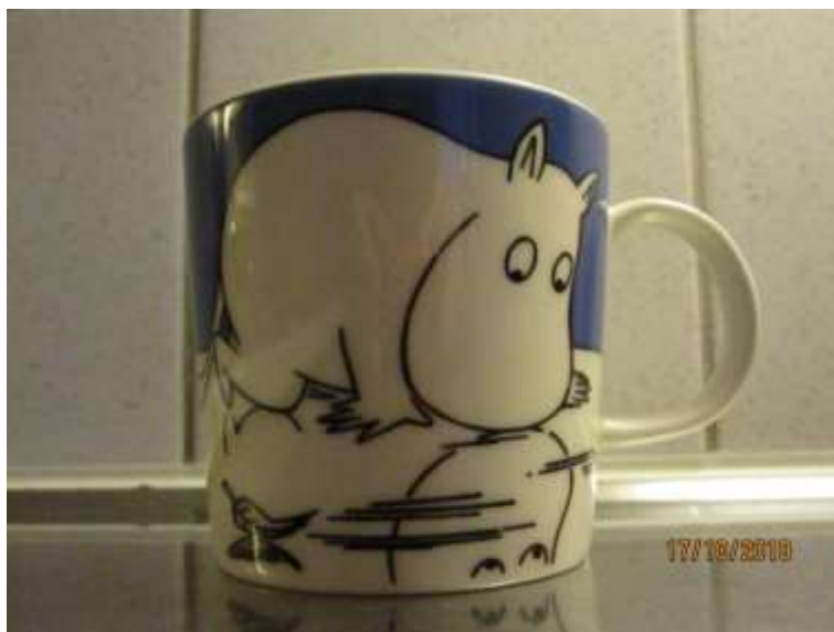
Photo 6 - Tove Jansson = Finland-Swedish! Moomin = Finland-Swedish! + The mug has the same form as the mug designed by Kaj Franck = Finland-Swedish!