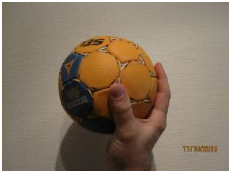
Photo 3 - Handball is clearly a sport where the players often are Finland-Swedes.