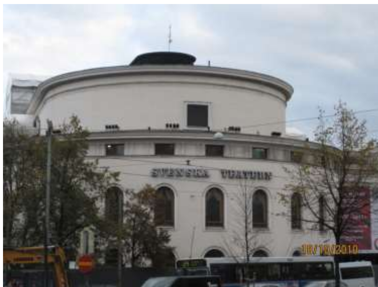
Photo 5 - - Where do we go to see plays in Swedish? – In the Swedish Theater of course!