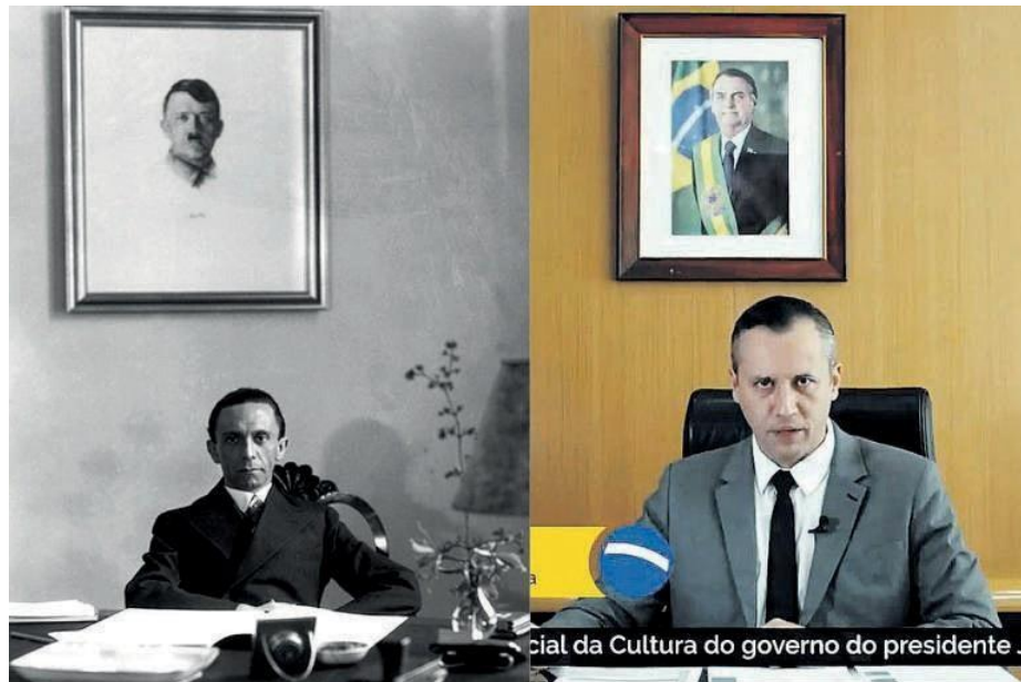
Figure 4 Goebbels in the left; Alvim in the right.

The German art of the next decade will be heroic, will be strongly romantic, will be objective and free of sentimentalism, with great pathos and equally imperative and binding, or it will be nothing. (BARROS, 2020)