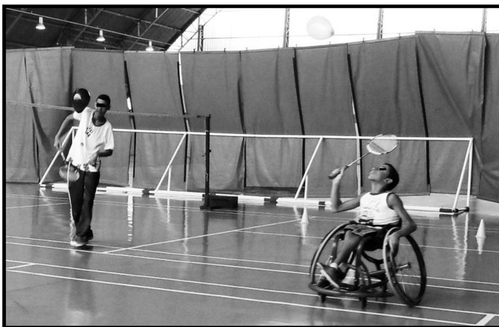
Picture 2 - Lesson 1, to keep the balloon in the air with the racket.

Among the 10 lessons of module 5, 46 activities were implemented. From them, 12 required adaptations or modifications. We observed that the first 10 lessons were easily adapted to people with disabilities (Picture 2).