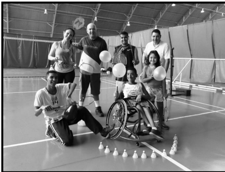
Picture 5 - Finishing a lesson.