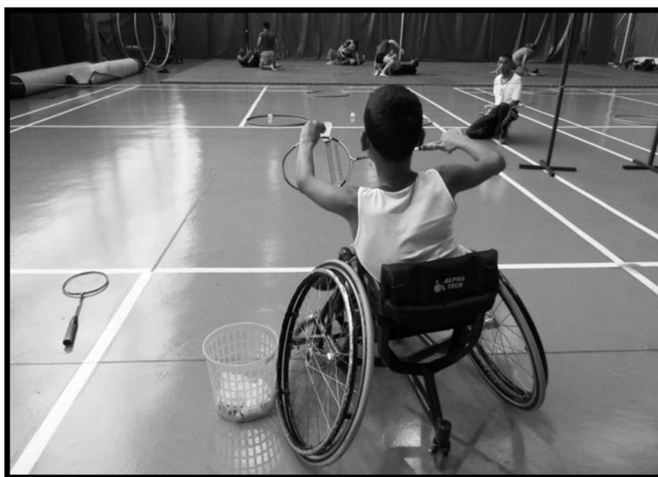
Picture 4 - The service.