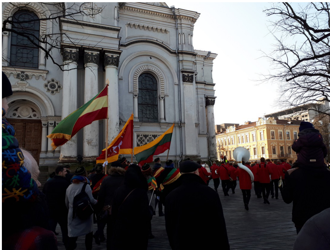
Figure 2: Parade for the Restoration of the State Day (Kaunas), February 16, 2019.

Along this line of reasoning, it can be concluded that the persistence of religious hegemony is determined by the fact that Catholicism still represents an integral part of the dominant narrative about what it means to be Lithuanian. In a context vastly dominated by one hegemonic religion, the minority religions are seeking to construct persuasive strategies of legitimating their authenticity vis-à-vis the dominant narrative (Ališauskienė, 2012: 153). Or, in the case of Lithuania, they either need to find a way to challenge the publicly constructed vision of convergence between Catholicism and “Lithuanianness”, or to convince their potential followers to make the perceived “break with culture” pointed out by Schröder. The particular case of the Ethno-Pagan organization Romuva discussed in this paper deserves scholarly attention with regard to the concepts related to the religious marketplace model because it represents a unique example of an alternative religious offer, which contests the hegemonic position of the Catholic Church while also allowing for maximization of cultural capital. Let us first briefly outline the key aspects