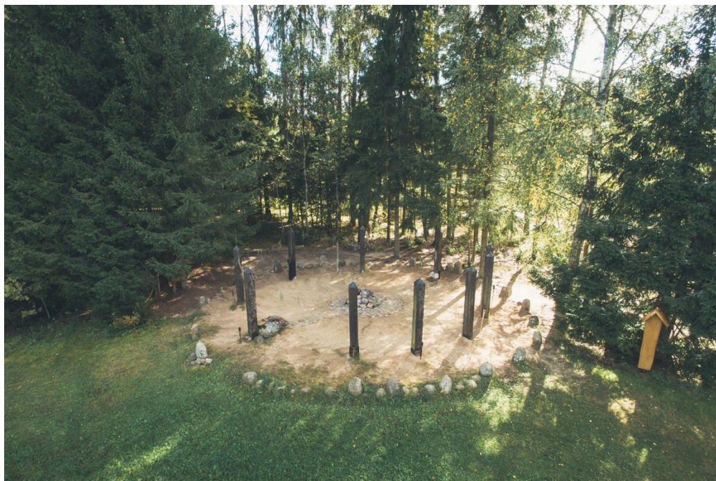
Figure 4: The Ancient Observatory of Celestial Bodies.

The observatory represents a circle of 10 wooden pillars, engraved with the ancient Baltic calendar sign, and a fire altar placed at the center for the purpose of conducting rituals. Nearby, a temple of stacked stones, dedicated to the ancient Baltic god of fire, thunder, and lightning Perkūnas, is being built progressively by the community of Romuva.