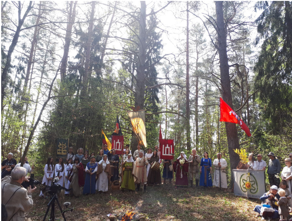
Figure 8: Rituals at the castle mound, April 27, 2019.