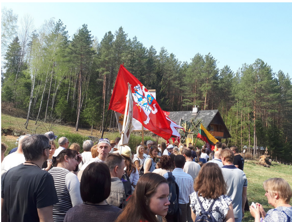
Figure 7: Procession from the Ancient Observatory to the castle mound, April 27, 2019.