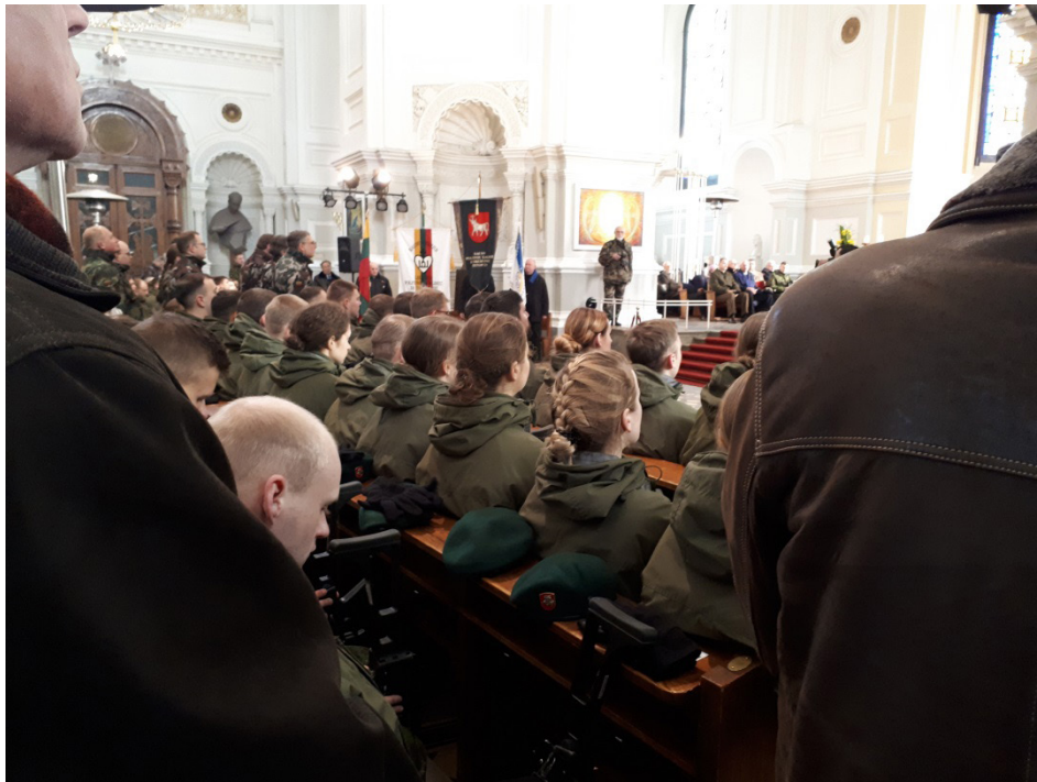
Figure 1: Lithuanian military forces gathered at the St. Michael the Archangel Church (Kaunas), February 16, 2019.

The festival was organized on an impressively large scale and involved a variety of social actors, which indicates its significance for the national consciousness. The program included all kinds of activities and events happening across the city, such as jogging competition, solemn parade through the main streets, several concerts, football matches, exhibition inaugurations, free admission to all museums, etc. Worthy of mention is that the opening event of the celebration was the Holy Mass at the St. Michael the Archangel Church, where a significant number of soldiers in military uniforms were gathered. The depicted bond between the church, as a guardian of the national identity, and the army, as a protector of sovereignty, conveys the idea that the collective imagination regards Catholicism as deeply entrenched in the national consciousness.