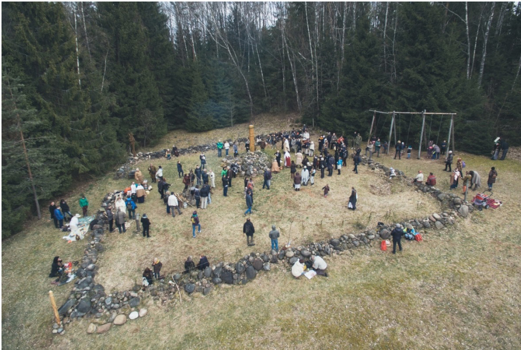
Figure 5: People gathered at the temple of Perkūnas.