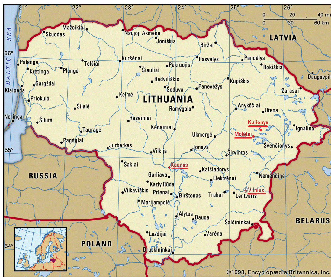
Figure 3: Map of Lithuania showing the geographic position of the village of Kulionys (Molėtai District).