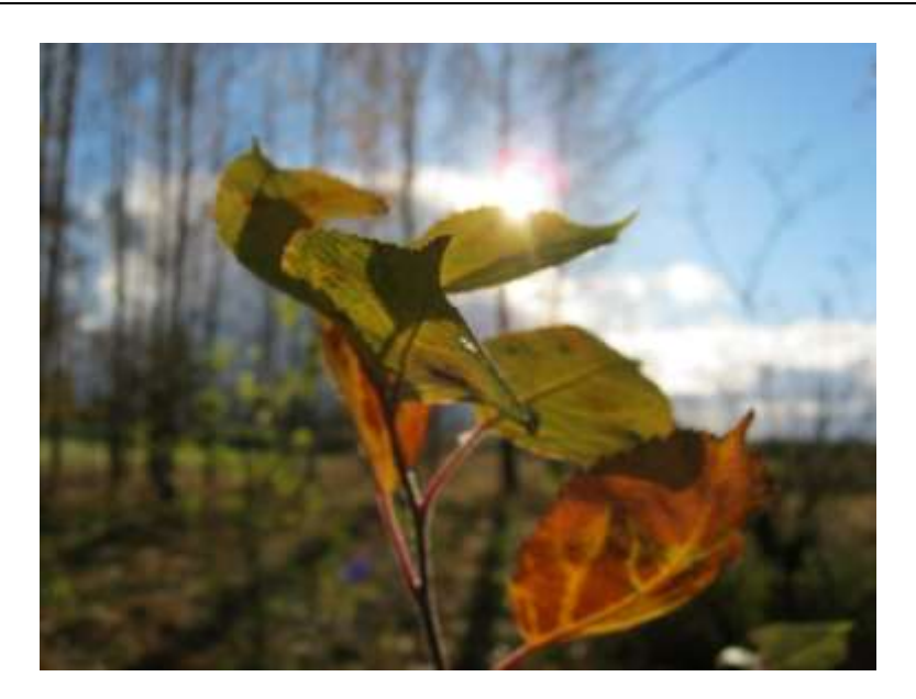
Photo 15 - Finland-Swedishness is like fall, a time no one really looks forward to

There are many photographs and comments about that it is fine now but for how long? They are wondering if there is a future for this minority language group and thereby for themselves. However, they are happy with who they are even though they are wondering about their future. In the interviews the language and language issues were emphasized and this came through in the photographs as well especially in the literal, concrete photographs. However, as can be seen above there is also another kind of photography – the more metaphorical. The metaphorical photography brings forth a deeper level of thinking about the minority language group. Who are they and where are they rooted, what are they happy about and what are their worries. These issues were not brought out in the interviews. Hence, it is clear that the participatory photography and the interviews complement each other and give a fuller picture of the students' thinking.