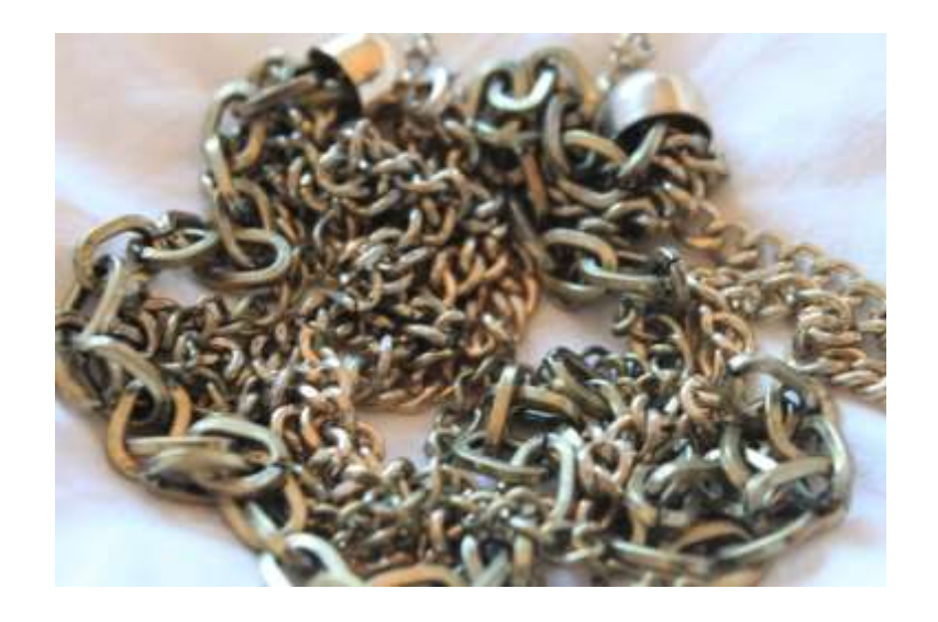
Photo 10 - We are like a chain. A tight group.

The saying about the Finland-Swedes is that everybody knows everybody since it is a small group and the students say this too with their photos and in their interviews. The language is perceived by the students to be the common glue together with the Swedish-speaking school. Interestingly the students have redefined who is a Finland-Swede. It used to be defined as a person who registered as a Swedish speaker, but the students have redefined it as someone who speaks both Swedish and Finnish and goes to a Swedish-speaking school. Hence, especially the photographs depict a language group which position is not static but in constant movement.