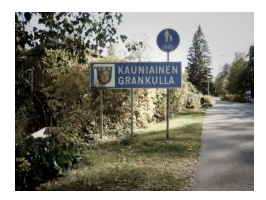
Photo 7 - Many Swedish-speakers live in this community (bilingual sign)

Likewise there are numerous photos of bilingual street signs through which the students in a way show the group's existence since the streets signs are only in Finnish unless the municipality contains 8% Swedish minority language speakers.