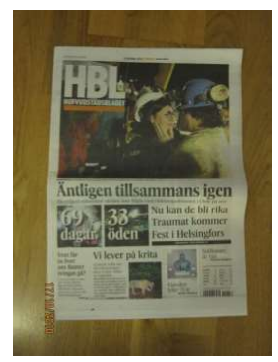
Photo 4 - HBL = a Finland-Swedish newspaper