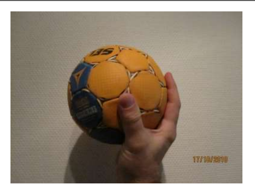
Photo 3 - Handball is clearly a sport where the players often are Finland-Swedes.