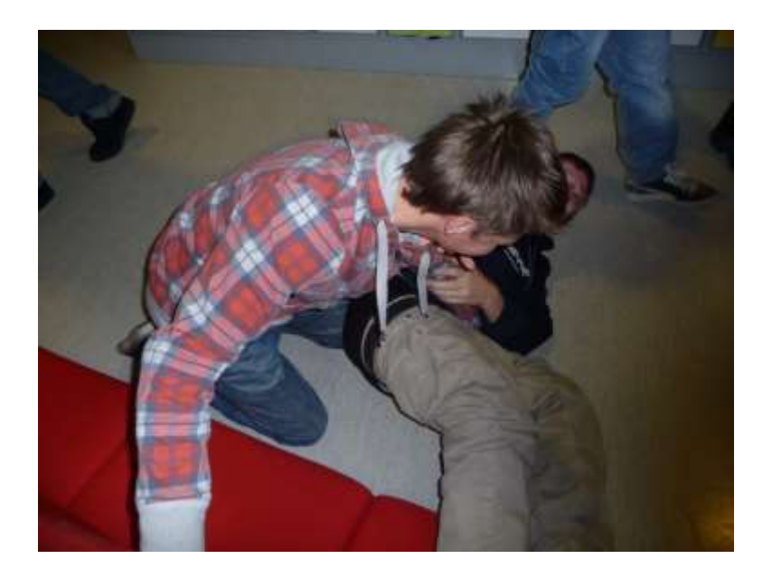
Photo 11 - We always have fun, even in school.