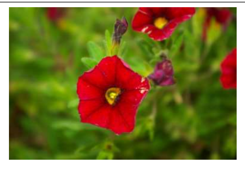
Photo 8 - The flowers symbolize the beautiful Swedish language

The symbolic or metaphorical photography provides a vehicle for the students to express their more abstract thinking about their identifications and belonging.