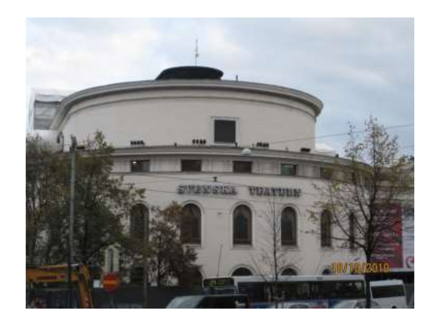
Photo 5 - - Where do we go to see plays in Swedish? – In the Swedish Theater of course!