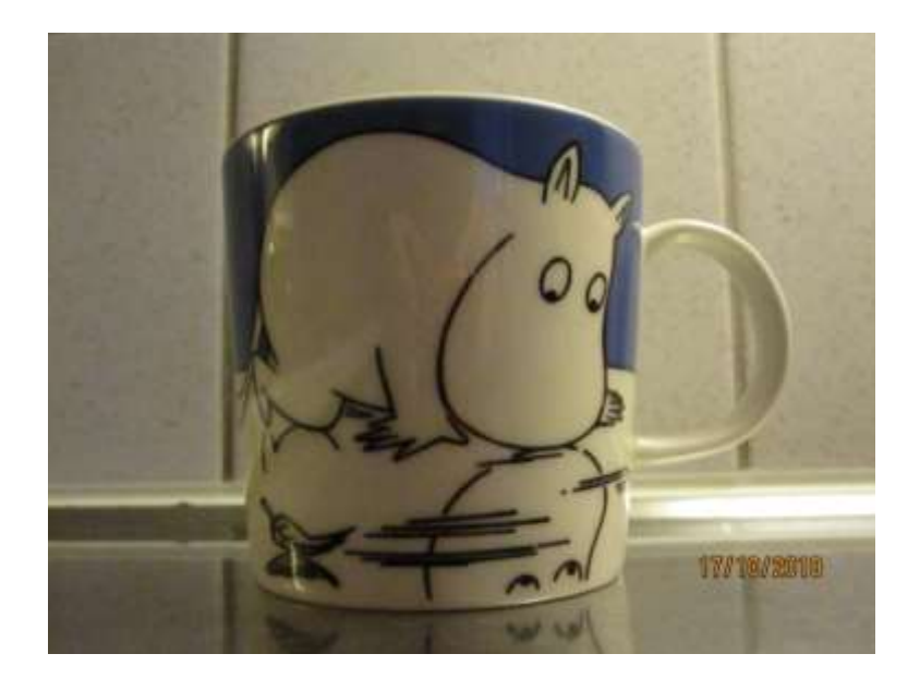
Photo 6 - Tove Jansson = Finland-Swedish! Moomin = Finland-Swedish! + The mug has the same form as the mug designed by Kaj Franck = Finland-Swedish!