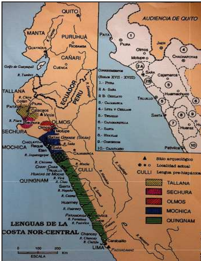
Figure 1: The Mochica area (in blue; from Cerrón-Palomino 1995: 34)

From Figure 1 we can also identify the coastal languages with which Mochica was in contact or neighbored in the 17 th century. Not pictured, but known to have been spoken in adjacent inland areas at the time of contact were Kulyi (directly to the east of Trujillo), Yúnqay (both Peripheral Quechuan languages, to the north east of the Mochica area), and Quechua, as well Cholón and Híbito (Cholónan languages spoken further east than Kulyi) (Kaufman 2007: 84).