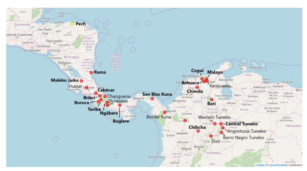
Map 1: Geographic location of Chibchan languages (Hammarström et al. 2019), base map provided by OpenStreetMap [openstreetmap.org]). Note that the Bokotá and Sabanero varieties are represented on the map with Buglere.