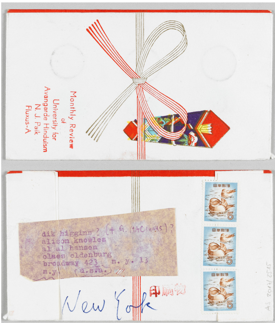
FIG. 1. Nam June Paik, cover and back sides of an envelope, mail art series Monthly Review of University for Avangarde Hinduism/N. J. Paik/ Fluxus-A, various letters, partially filled with coins and other small items, ca. 1964. Archiv Hanns Sohm, Staatsgalerie Stuttgart, Inventory no. AS 2017/2515.

dripping water and an empty vessel are arranged so that the water falls into the vessel,” 2 or Yoko Ono’s Cut Piece (1964), in which a performer asks the audience to cut her clothes with a scissor. Typically, the scores were performed on stage in events announced as “concerts”, provoking shocked responses from audiences because they did not conform to the conventions of highly elaborated classical instrumental music or narrative theater.