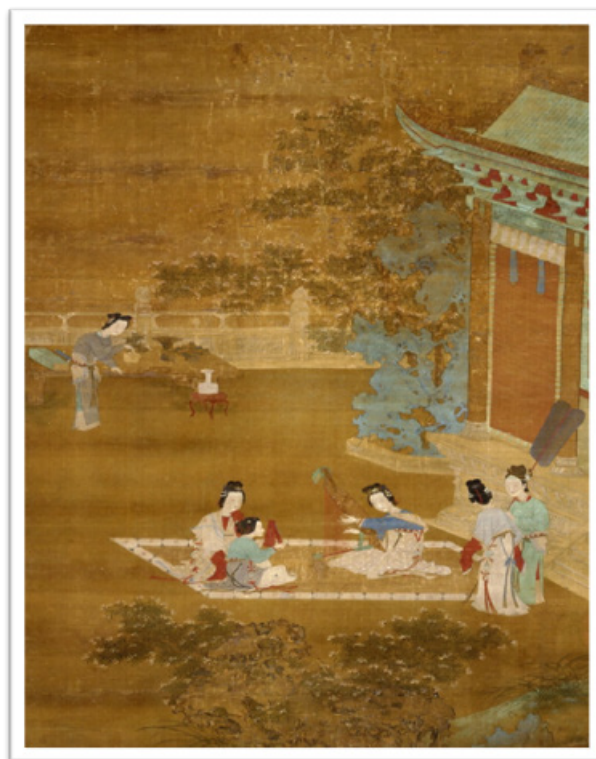
FIG. 2. Qiu Zhu. Women Musicians , Ming Dynasty, hanging scroll, color on silk, 145x85.5 cm. Author' archive.