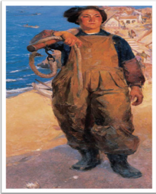
FIG. 6. Wang Xia, Island Girl , 1961, oil on canvas, 173x84cm.

women participated in individual, national and international liberation but not, as Marx foretold, under conditions of their own making” (Chen, 2003: 291-292).