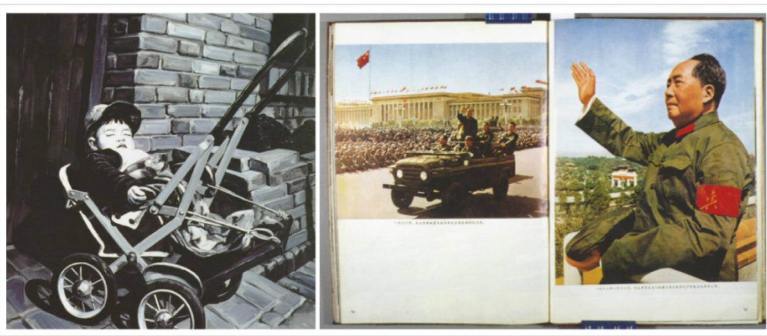
FIG. 9. Yu Hong, 1966 Six Month Old in Xian, 1999, oil on canvas, 100x100 cm

their non-existence, however. As male counterparts discovered profound subjects and the art market embraced China's avant-garde, woman returned to herself, searching for self-identity and the expression of female experience. "Once women attempted to use personal experience and 'women's perspective' to interpret this century, women's creative works were not only different from male artists, but also different from the work of any former era of women. Therefore, this singular practice embodied 'women's art' and the advance of these concepts composed the topical content of 'women's art' and its 'post-modern' overtones" (Jia, 2010).