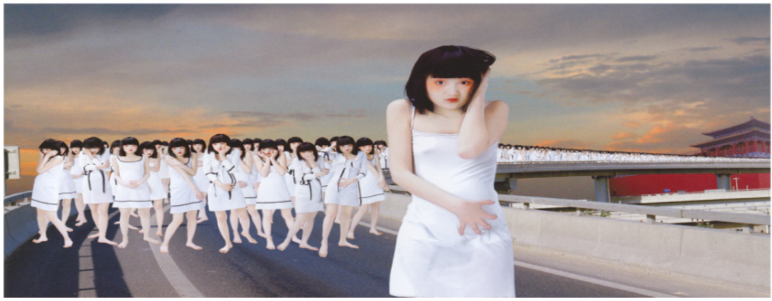
FIG. 13. Cui Xiuwen, Angel No. 4 (2006), photograph.

Women's artistic experiments involve not only controversial issues but also wide-ranging mediums and materials. The play of innovative imagination frees women's art from conventional norms of traditional painting or modern learning and opens ample possibilities: in installation or sculpture, photography or video, performance or multimedia. Women artists who incorporate materiality in the field of installation art, for instance, demonstrate how crafts or weaving can become a process of art-making. Li Xiuqin's large-scale rock and wood sculptures, The Journey of Life (1997) and The Gate of Life (1998), offer a vision of life through the form and substance of the materials dominating the site. Shi Hui's soft sculpture series, Nest , Chains , and Knots (1995) [Fig. 14], by contrast, finds expressivity in weaving and crafting via fiber or threads. Jiang Jie's wax sculptures of infants and the fetus uncover the brutality of China's one-child policy and the vulnerability of the victims, as implied by the sheer frangible materiality. Lin Tianmiao is well known for her novel use of materials, especially cotton threads. Her