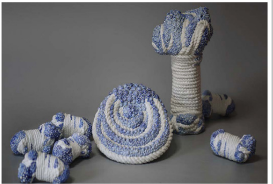
FIG. 19. Liu Xi, Summer Time No.1 , 2017, Porcelain, 52 x 46 x 6 cm.