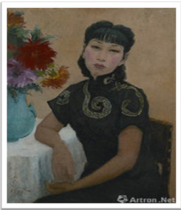
FIG. 3. Pan Yuliang, Self Portrait , 1941, oil on canvas, 96x64 cm.

identity finds a visual trope in the hairstyle and dress code of qipao. The languid eyes and unyielding lips reinforce the expression of melancholy. The color hues nonetheless cheer as well as contrast the lonely self in black with a bright-colored green vase, beautiful flowers, white tablecloth and saturated light against a brown background [Fig. 3]. The conception of modernity comes to terms in the self-portrait, as a modern female subject, absent from the Chinese art tradition, assumes a new, western form. For a woman to be modern, Pan's career suggests, one needs to transcend familial virtue and endure the rigors of exile.