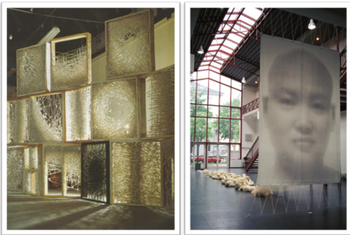
FIG. 14. Shi Hui, Knots 3 , 1995, installation, 270x800x120 cm.

early work The Proliferation of Thread Winding (1995) displays a bed with an oversized black hole, penetrated by needles [Fig. 15]. Stretched from the center and connected to the bed are uncountable balls hand-wrapped with cotton threads.