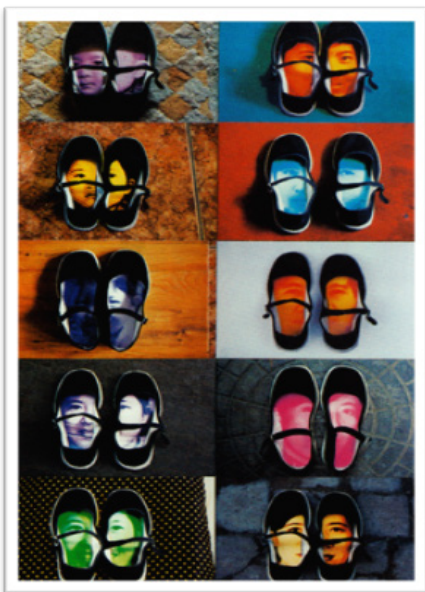
FIG. 10. Yin Xiuzhen, Yin Xiuzhen , 1998, mixed-media installation with ten pairs of shoes and ten chromogenic prints.

matter and formal innovation, women's visual art appeared unmatched in modern art history going back to early twentieth-century China. Yu Hong's oil painting series Witness to Growth [Fig. 9], for instance, re-positions woman as artist and subject by situating a personal coming-of-age narrative against social-political history, thereby fusing the personal and political. Yin Xiuzhen's installation, Yin Xiuzhen (1998) [Fig. 10], claims a self-identity by inserting personal photos of her at different ages into the handmade cotton shoes, fabric icon of the social-historical past. Liu Manwen's self-portraiture series, Ordinary Life [Fig. 11], locates a troubled self against familial relations and social-cultural confinement; Liu uses mirror reflection and spatial articulation in the search for self-expression. Liu Hong's female nude, Self-monologue (1997), by concealing the face and head of the female figure with red cloth, dislocates the individual from public display to a private realm, where a monologue unfolds within the inner self. In these examples, we see the artist searching for a female-self from either a social-political history that has suppressed her historical position or from a psychological realm that supports personal expression.