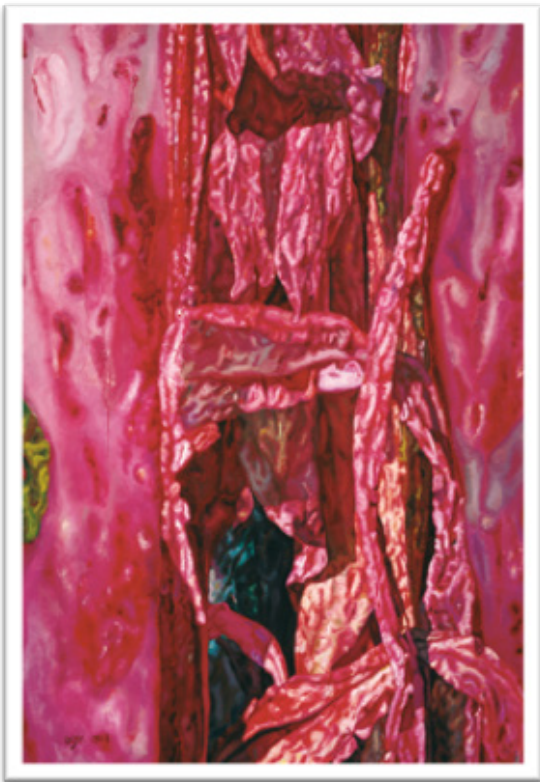
FIG. 12. Cai Jin, Banana Plant No. 68 , 1995, oil on canvas 160x150 cm. Author' archive.