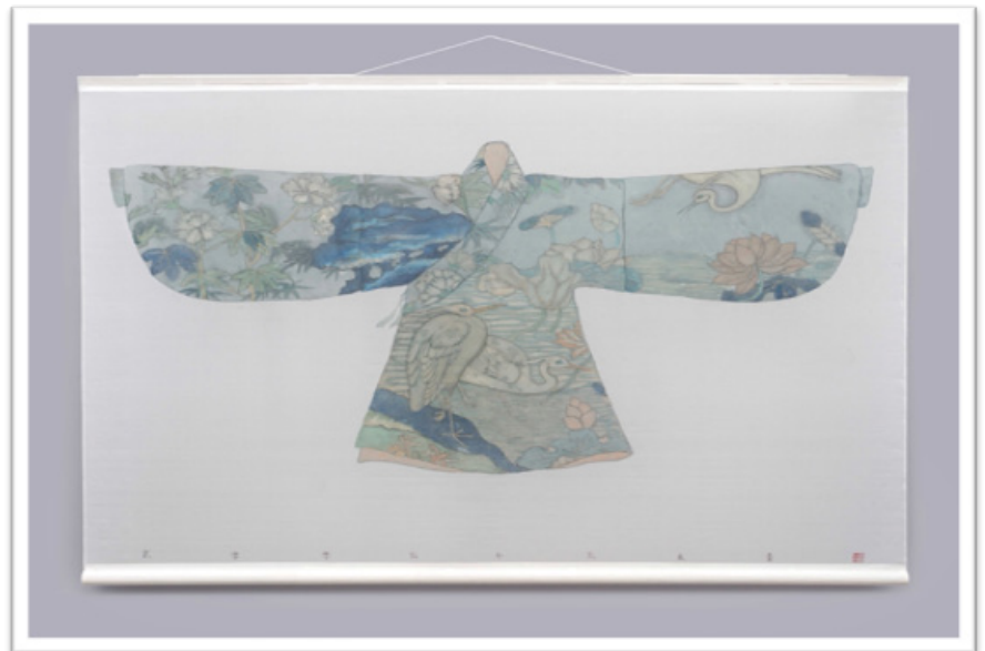
FIG. 17. Peng Wei, Autumn of Tang Dynasty , 2008, ink on paper, 70x39x22 cm. Author's archive.