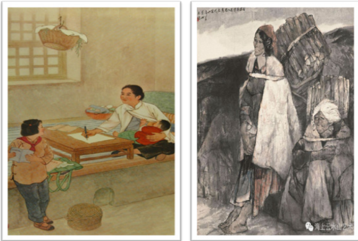
FIG.7. Jiang Yan, Testing Mother , 1953, 113.6x64.6 cm.

political conditions, women artists attempted to include certain female touches and gendered inscriptions in their work.