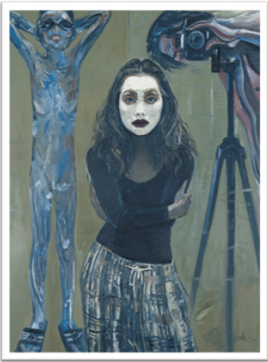
FIG. 11. YLiu, Manwen, Ordinary Life , 1993, oil on canvas, 162x130 cm.