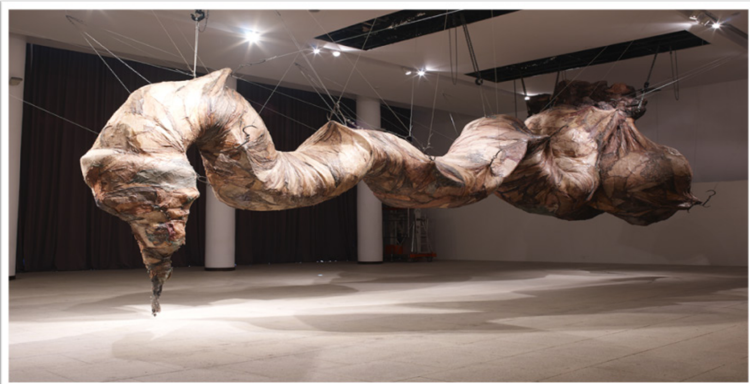
FIG. 16. Jjiang Jie, Over 1.5 Tons , 2014, epoxy, iron, 1000x4000x4800 cm. Author' archive.

female sculptor, through her selection of subject and material, creates a feminist art practice both alluring and repulsive. In other words, the phallic imagery no longer signifies desire or symbolizes power but rather points to an impotent, vulnerable, and fragmented body: the phallus in its death throes. Its survival and constancy depend on a special sculptural form and material support, created as well as manipulated by the female artist 10 .