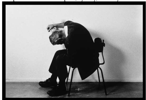
Figure 2 - Mike Parr. Malevich (A Political Arm) Performance for as long as possible. 2002. The performance at Artspace, Sydney, 3-5 May 2002.