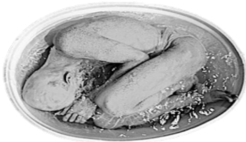
Figure 3 - Lee Wen. Journey of a Yellow Man No.11. 1997.