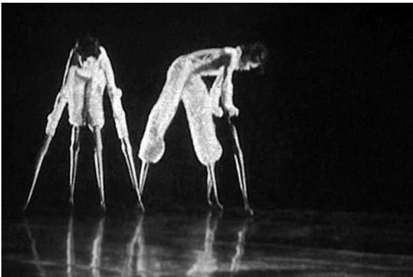
Figure 4 - Lisa Bufano. One Breath is an Ocean for a Wooden Heart. 2007. Video still of the performance in collaboration with Sonsheree Giles.