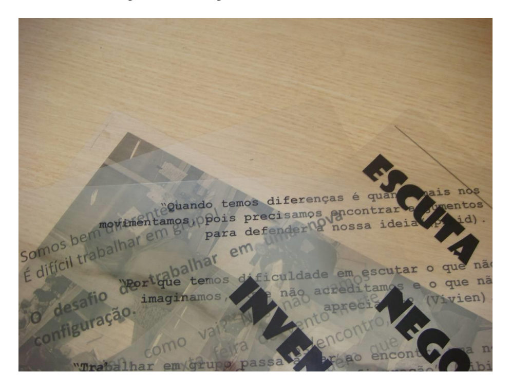
Figure 5—Diary of Researcher 1 (2013)

Beyond the students' diaries, the production of our own personal diaries, one for each professor, also contributed to our thinking about some concepts and about teaching. This was made present with more intensity when, in order to handle unpredictable elements and different connections, we needed to put our concepts of event in motion.