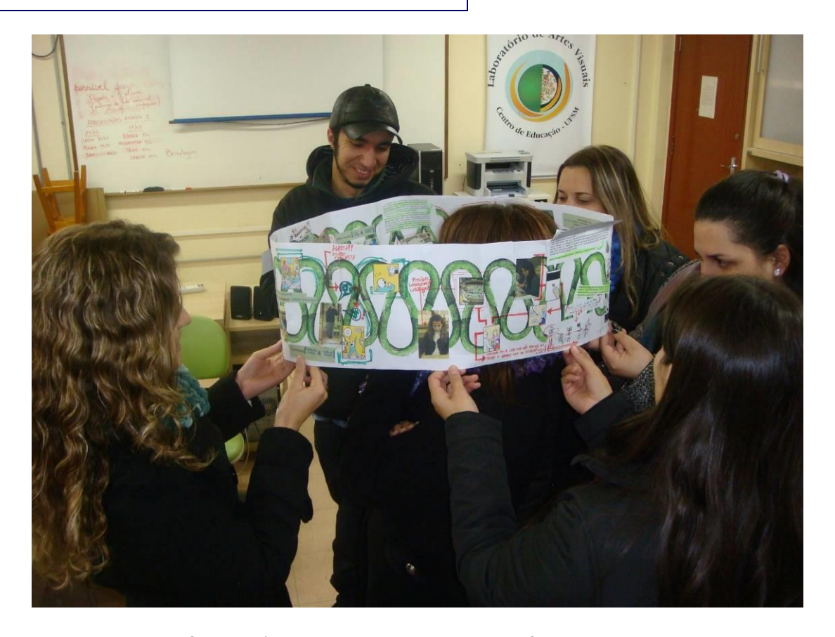
Figure 1—Student A's diary for the class Estágio Supervisionado IV (2013)

During the classes, the diaries were presented three times, two while they were being produced, and one at the end. Exposing the diaries to the group contributed for making thought clearer and more organized. It enabled a crisscrossing in the meetings, in which a multiplicity of experiences was reported and discussed. We saw ourselves in many situations in our colleagues' diaries, we put ourselves in their places, and we started thinking about our practices as teachers. This narrative environment of individual's thoughts contributes for a fruitful exchange play. At the same time, it was a moment of retaking a travelled path, since it was possible to notice what made sense to students, what impressions they had of the classes and of the internship experiences, what conversations they were able to establish between their "teaching selves under construction" and the texts, the poetry, and the images proposed.