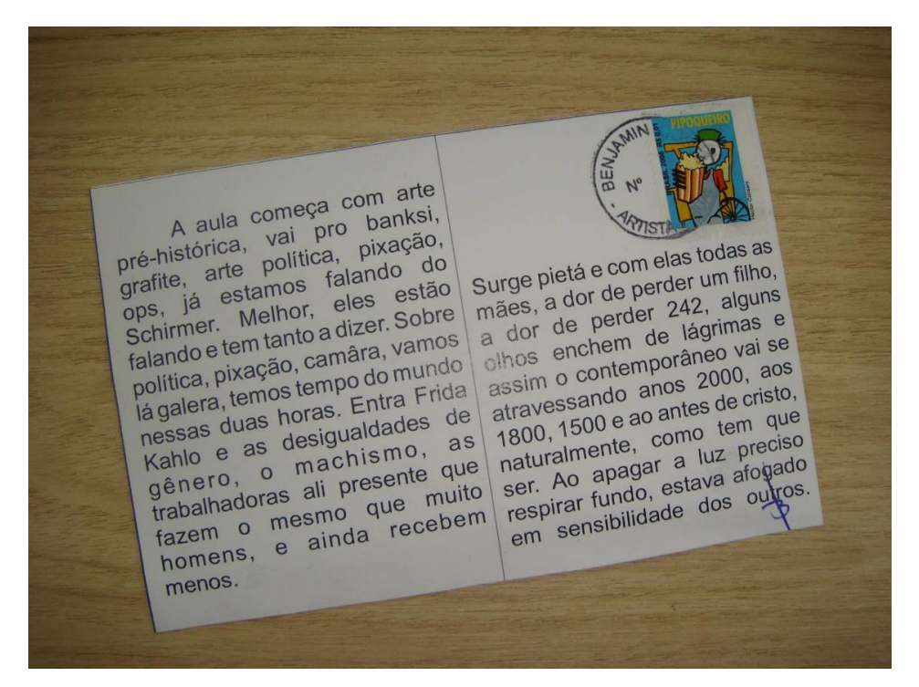
Figure 2—Student B's Postcards diary for the class Estágio Supervisionado IV (2013)

Deleuze and Guattari (1994, p. 156) state that "the event is not the state of affairs. It is actualized in a state of affairs, in a body, in a lived". In this movement, things are acquired, lost, and displaced, and a field of incidents is constituted to accommodate the particularities. In the event, the instant is actualized and it ends up producing another moment, since different weavings become interconnected and establish unexpected relationships.