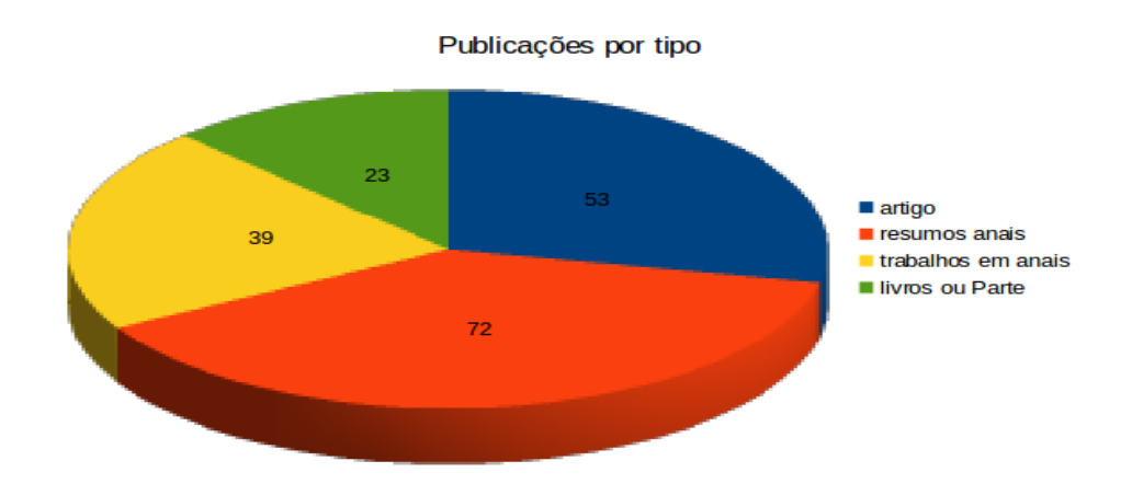
FIGURE 2 - Typology of Publications of IFSP Librarians.

As a different way of demonstration, it was elaborated the graphic exposed in Figure 2, which refers to the typology of publications of IFSP librarians.