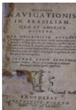
Figure 3. LÉRY, Jean de. Historia Navigationis in Brasiliam, quae et America dicitur: Qua Describitur Autoris navigatio, ... A Joanne Lerio Burgundo .... Genève (Suíça): Excudebat Eustathius Vignon, 1586. 358 p.

To date, 687 artistic works were mapped on the Salvador campuses, and mapping is expected to continue. With regard to literary works, 339 rare works (Figure 3) of the sixteenth to eighteenth centuries have been cataloged in the Memory Seats coordination - Baianos Studies, of the UFBA Library System. Still to perform in this information unit is the inventory of the vast collections of the nineteenth and twentieth centuries, which have copies belonging to collections of bibliophiles, bibliographers and collectors, donated or acquired by the University.