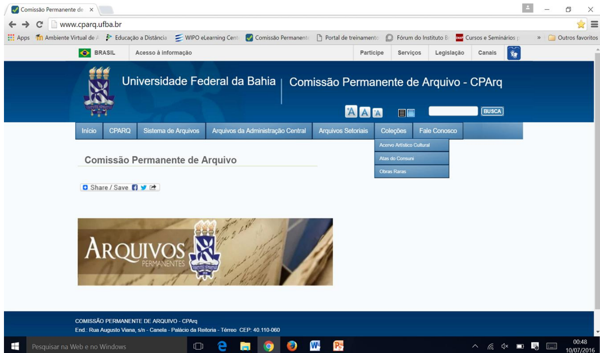
Figure 2. Artistic Cultural Archive Inventory, Cosuni Reports, Rare Works.