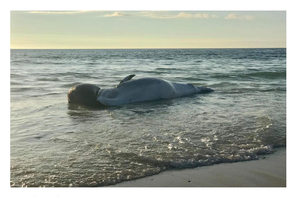
Figure 2. Photograph about the new «Baleia morta dá à costa no Furadouro»