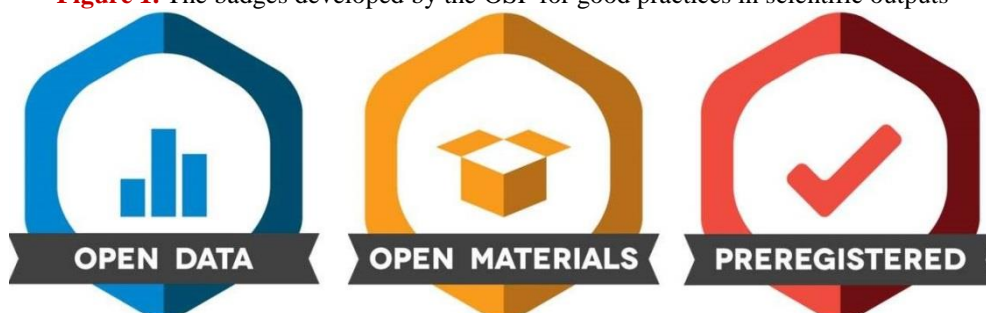
Figure 1. The badges developed by the OSF for good practices in scientific outputs

Noteworthy here is the work of the Open Science Framework (OSF), an effective proposal for good scientific practice, offering a solution for how it can be attained. This system features three badges which are: Open Data, Open Materials, and Preregistered, as seen in Figure 1 below: