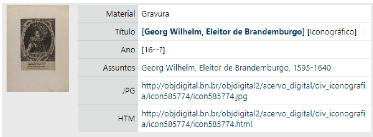
Figure 3 - Metadata descriptors of digital documents