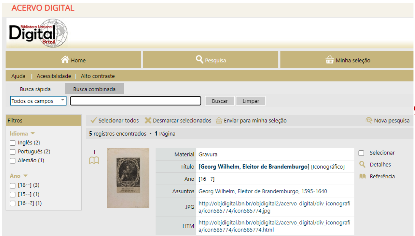
Figure 2. BNDigital Online Catalog