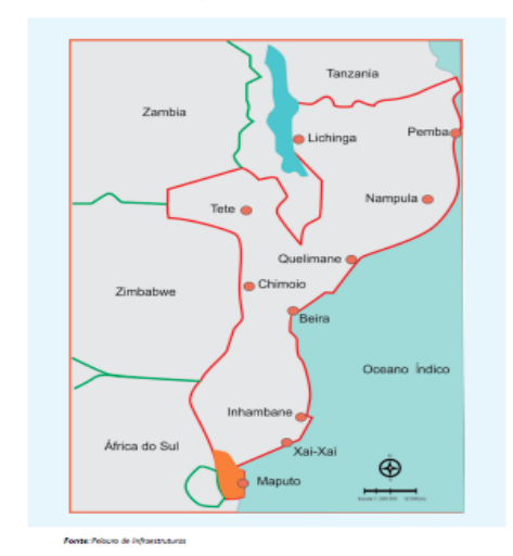
Mapa 1. Localização Geográfica