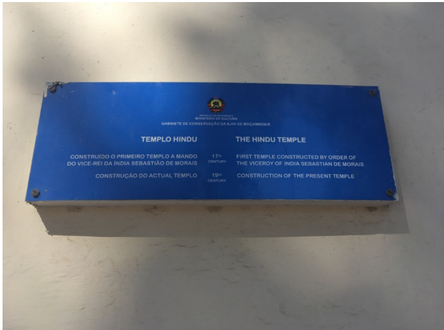
Figure 3: Mozambique Island Hindu Temple.