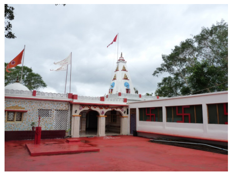
Figure 4: Salamanga Hindu Temple.