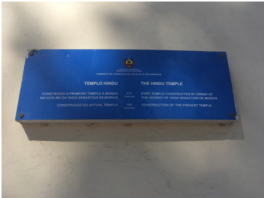
Figure 3: Mozambique Island Hindu Temple.