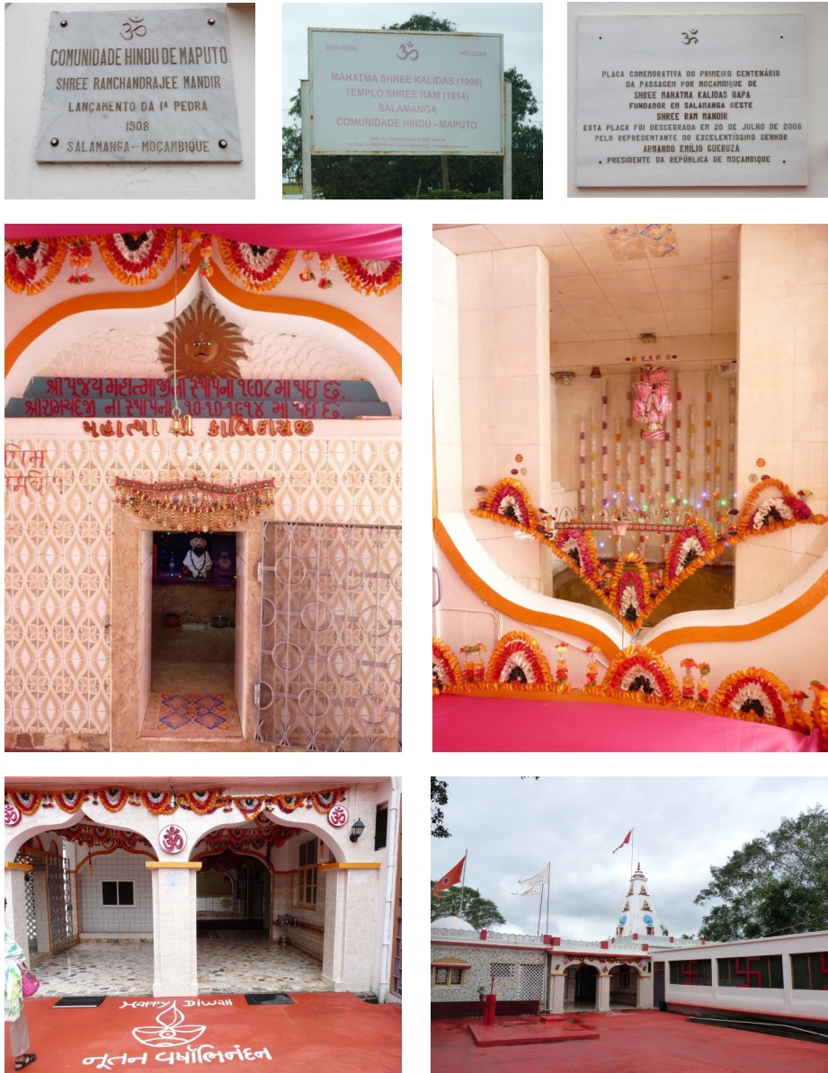
Figure 4: Salamanga Hindu Temple.