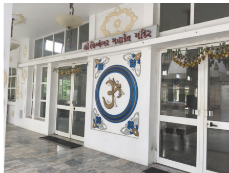
Figure 5: Lourenço Marques/ Maputo Ved Mandir Hindu Temple.