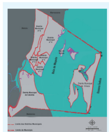
Mapa 2. Divisão Administrativa do Município de Maputo