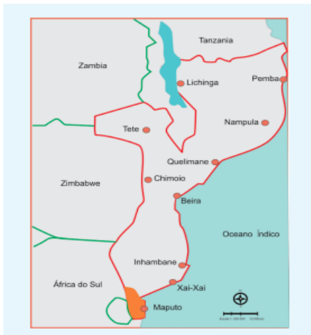
Mapa 1. Localização Geográfica

This study is situated in Mozambique's 20 th century capital, called Lourenço Marques (LM) before 1975 and thereafter Maputo. Though both refer to the same urban landscape, naming signals temporal and thus political differences. When the city is referred to as LM, Portuguese colonialism was underway. When Maputo is used, the country was independent. By virtue of this study being conducted in LM/Maputo, the ethnographic sample was comprised of people who did not emigrate permanently, if at all. Thus, the very site of intellectual discourse in defining macro-level causes of migration, naming the micro-level identities, and analyzing individuals' agency to determine their own identity and location during this particularly volatile period in Mozambican history was situated precisely within the liminal context of those who stayed behind. Oral histories of Indo-Mozambicans who stayed behind in Lourenço Marques/ Maputo from 1947-1992 showed the constant negotiations of location and loyalty allowed them to manage up and down shifting social hierarchies.