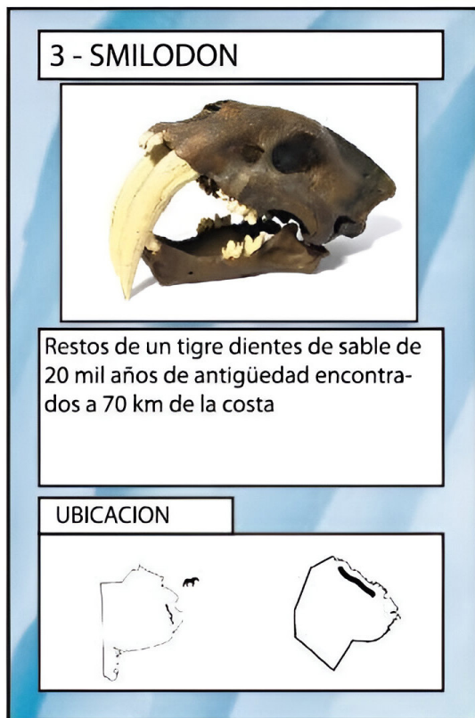
Figure 2. Image of one of the cards with fossil findings presented (Martín et al., 2017)

Following Hernández (2005), we consider that the acquisition of science-related competencies at school is vital for the development of a critical