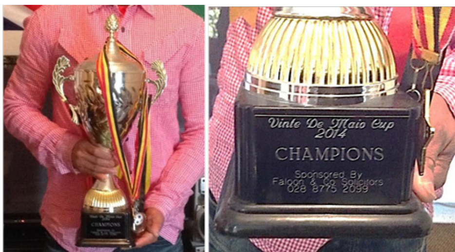
Figure 3. The cup and medals won by Fitun Unidade during the May 20 th tournament in 2014

The photograph on the left shows the cup and it shows the ribbons, which are draped around the cup and which are tied to the medals. The ribbons are in three of the colours of the national flag of Timor-Leste: Red, yellow and black. The photograph on the right shows the date of the tournament engraved on the base of the cup, in Portuguese and in English.