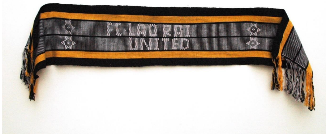
Figure 2. A black, white and yellow tait with the name of FC Lao Rai United.